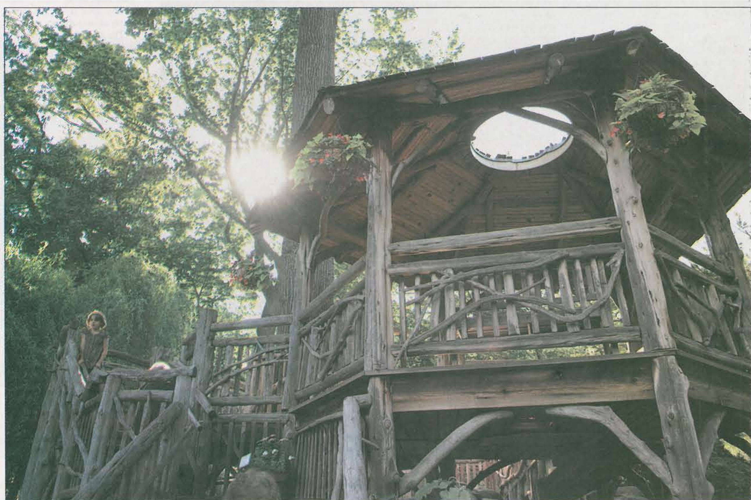
Its wheelchair accessible treehouse is one of the highlights of the Hershey Children's Garden in Cleveland which just celebrated its 10th birthday.